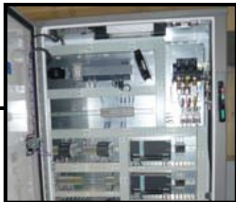
Professional Systems Design and Engineering Support