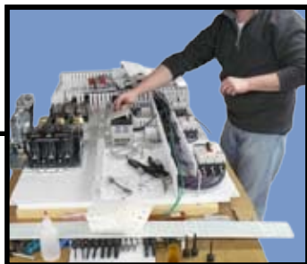
Project Management and Supply Chain Solutions