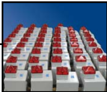
Delivering the High-Quality Electrical, Control & Automation products you need to succeed